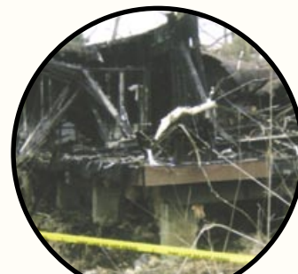
The exhibits took place the week of National “Kick Butts Day!”—April 11-15, 2005.

The project occurred over four weeks in March. The exhibits took place the week of National “Kick Butts Day!”—April 11-15, 2005.